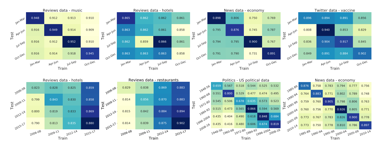
Figure 1: Document classification performance when training and testing on different times of year (top) and different years (bottom). Some corpora are omitted for space.